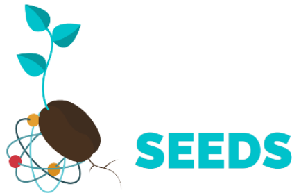
Figure 1. The SEEDS project logo.

The SEEDS project logo is a small seed superimposed onto a representation of an atom.